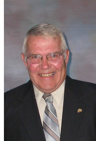
AMM Vice-President 1999-2002 AMM President 2002-2004