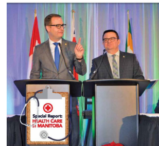
Meet the Minister of Municipal Relations

Looking to reach decision makers in Manitoba's Municipal Governments in 2018?