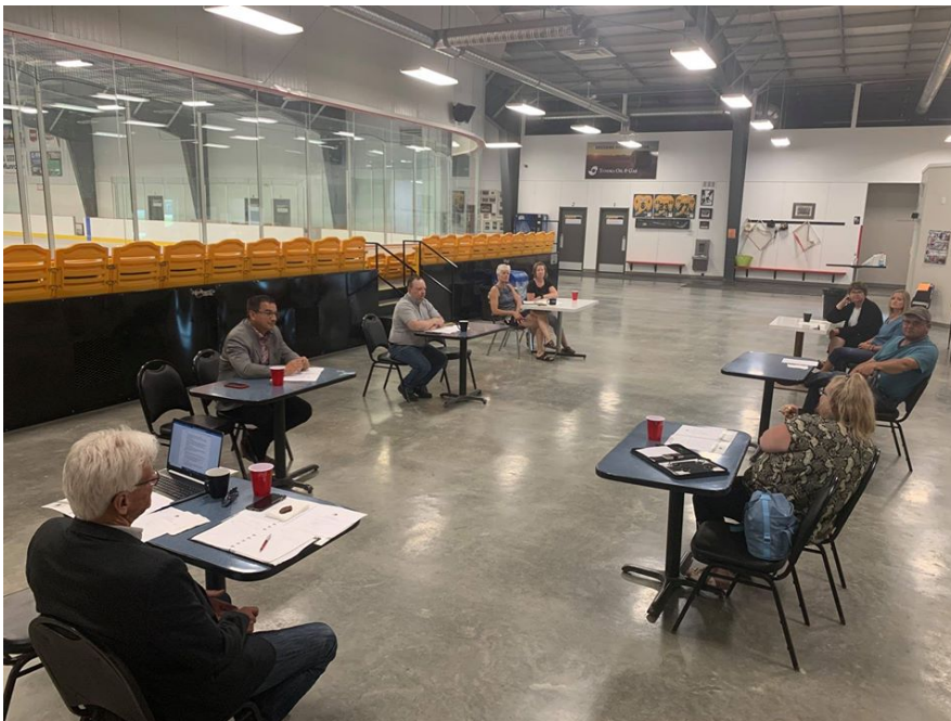
AMM and Municipality of Brenda-Waskada Council during their successful, socially distanced discussion

The AMM toured the Western District on July 22-24, 2020 and met with local councils from a number of municipalities. The AMM makes it a priority to visit each of its member municipalities at least once during each four-year election cycle