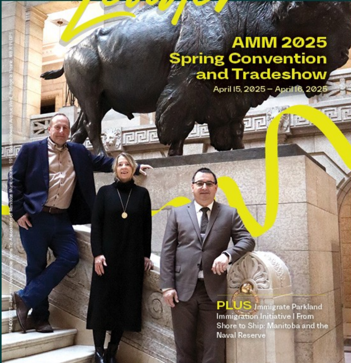
PHOTO: JEFFREY BROWN / GETTY IMAGES; SCULPTURE: BOB AND HELEN WOOD; PHOTOGRAPHY: JEFFREY BROWN

PLUS Immigrate Parkland Immigration Initiative | From Shore to Ship: Manitoba and the Naval Reserve