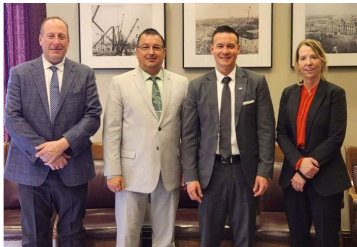
AMM Executive met with the Hon. Mike Moyes, Minister of Environment and Climate Change, focusing on municipal priorities. Departmental position paper can be found HERE .