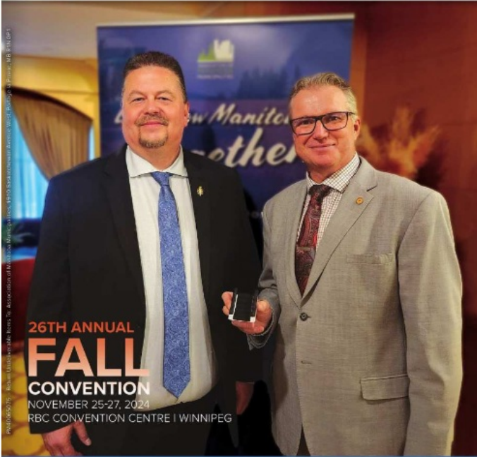
PHOTOGRAPHY: Royal United-Edwards Place, St. Association of Manitoba Municipalities, 1995 Saskatchewan Avenue West, Winnipeg, MB R3H 0P1

26TH ANNUAL FALL CONVENTION NOVEMBER 25-27, 2024 RBC CONVENTION CENTRE | WINNIPEG